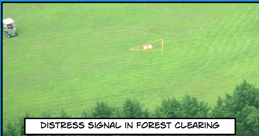
DISTRESS SIGNAL IN FOREST CLEARING