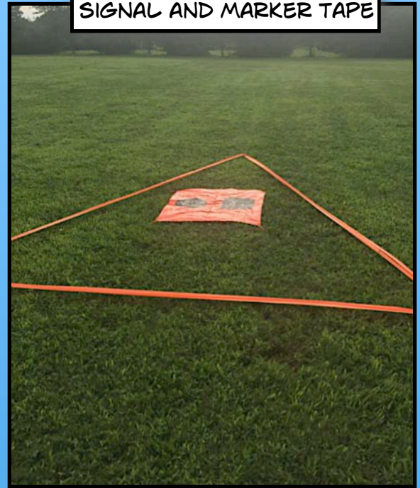
DEPLOYED DISTRESS SIGNAL AND MARKER TAPE