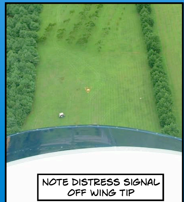
NOTE DISTRESS SIGNAL OFF WING TIP