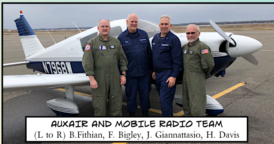
AUXAIR AND MOBILE RADIO TEAM