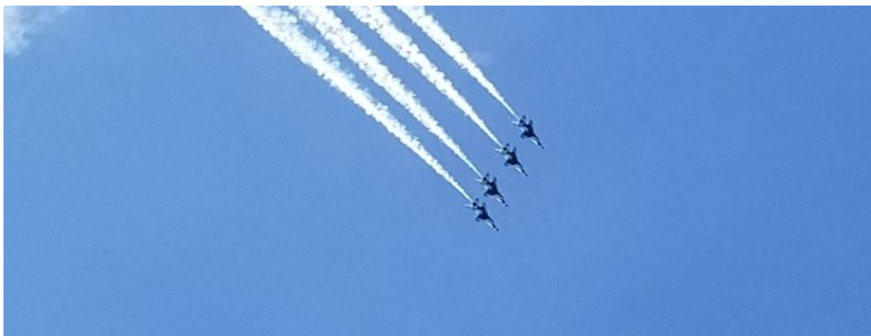
USAF Thunderbirds over the Boardwalk.