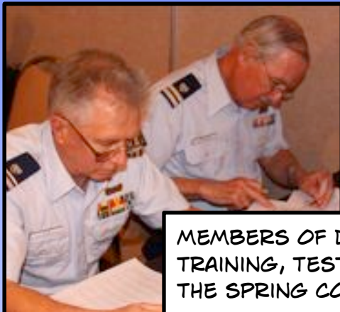
MEMBERS OF DIVISION 8 TAKE ADVANTAGE OF TRAINING, TESTING AND GREAT FELLOWSHIP AT THE SPRING CONFERENCE