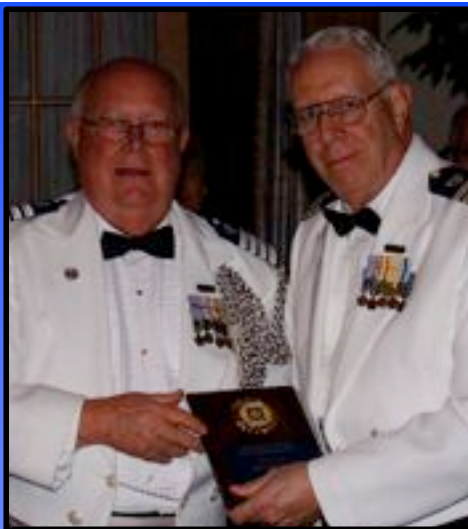
DIVISION 8 IS AWARDED THE MASSMAN AWARD FOR PERFORMANCE 2009!