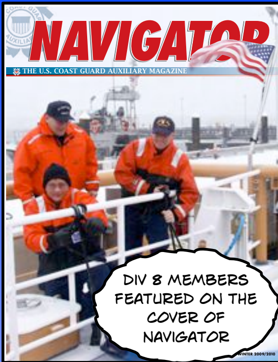
DIV 8 MEMBERS FEATURED ON THE COVER OF NAVIGATOR