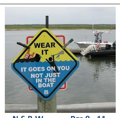
N.S.B.W. Pgs 9 - 11