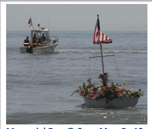
Memorial Day @ Cape May Pg 12