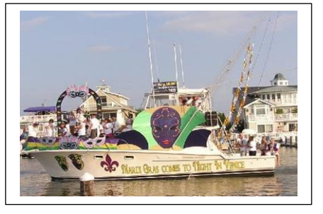
Past issues - <a href="http://www.a05308.uscgaux.info/publications.htm">http://www.a05308.uscgaux.info/publications.htm</a>