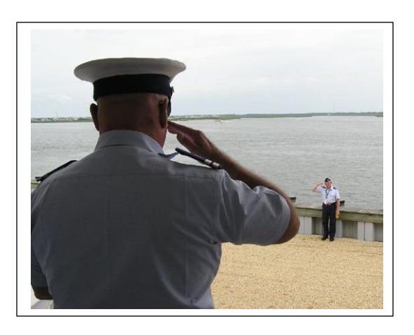
Past issues - http://www.a05308.uscgaux.info/publications.htm