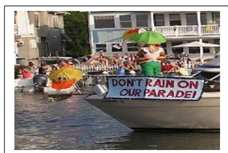
"Night in Venice" Boat Parade in OC - Pgs 15,16

Four Events Initiated by Individual Members.