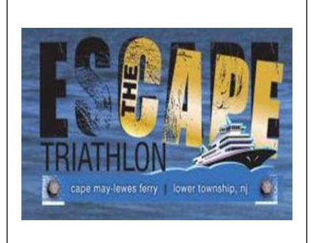
From Flotilla 8-3 Pg. 14