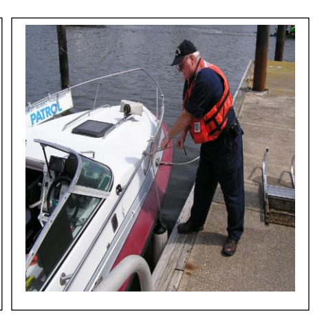
Above – Performing as a team, members assist other members arriving at USCG Station Great Egg.