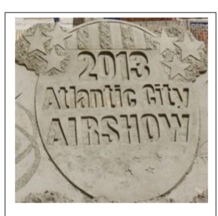
The CGAux Was There Pg 13