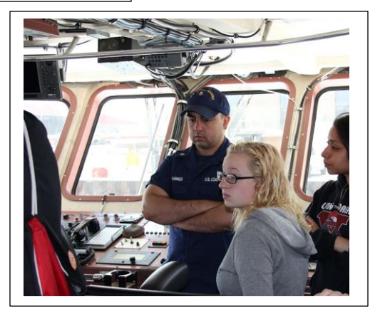
Past issues - http://www.a05308.uscgaux.info/publications.htm Division 8 Mariner - Summer 2013 | 20