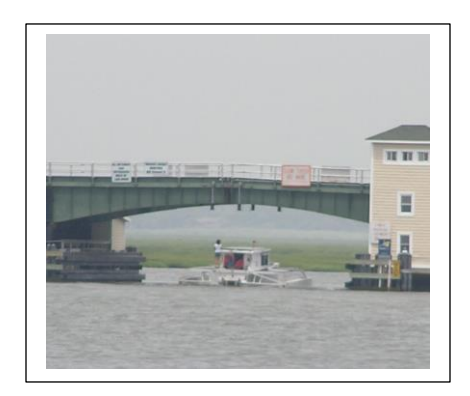
Past issues - http://www.a05308.uscgaux.info/publications.htm