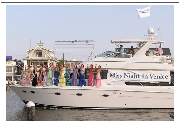
Below – Various folks and decorations on the parade boats.