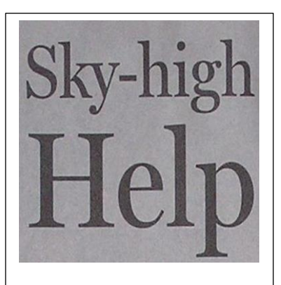
D. Drill & AUXAIR Pgs 5-8