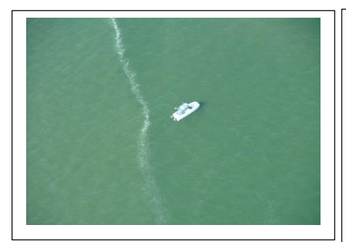
24' AUXFAC from 1000' altitude