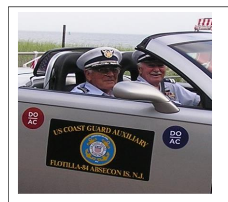
AC Armed Forces Parade Pg. 4