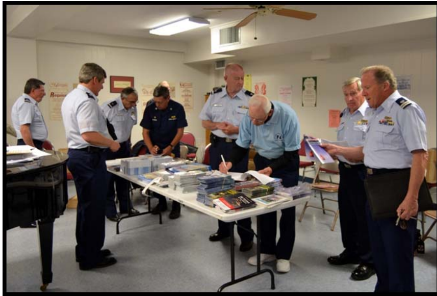
Our members are arming themselves with educational materials to pass on to the boating public.