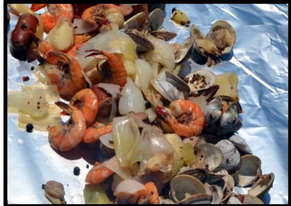
Our chef turned out a great seafood treat as well as the traditional hotdogs and hamburgers.